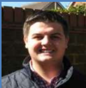
George Marshall-James Chair