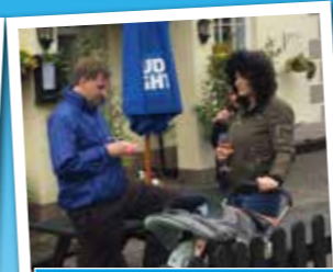
Special village surgery at Micheldever Station outside the Dove Inn.