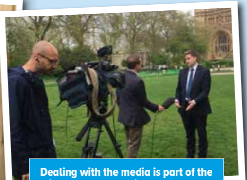
Dealing with the media is part of the job; here announcing a new plan to help children living with alcohol dependant parents.

Other work I have been involved in this past year as part of my role within Government include; eliminating HepC and winning the battle against HIV, debating the future of high energy drinks on sale to children, the proposed pay rise for NHS staff, promoting the UK rare diseases strategy,