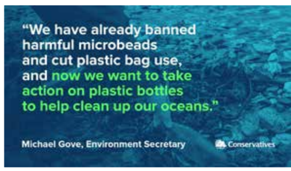
Michael Gove, Environment Secretary