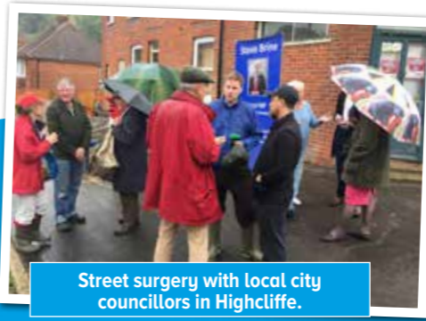
Street surgery with local city councillors in Highcliffe.