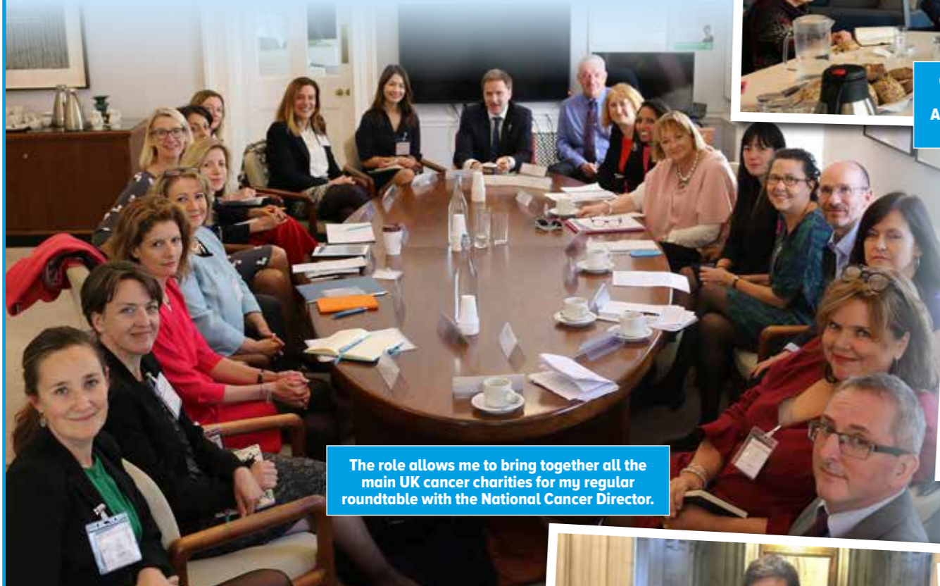
The role allows me to bring together all the main UK cancer charities for my regular roundtable with the National Cancer Director.