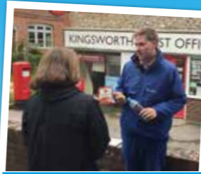
Street surgery in London Road, Kings Worthy outside the Post Office.