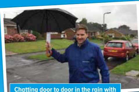
Chatting door to door in the rain with residents on Teg Down.