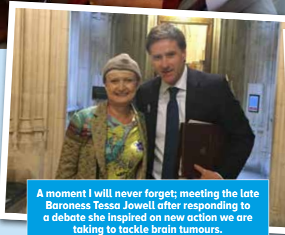
A moment I will never forget; meeting the late Baroness Tessa Jowell after responding to a debate she inspired on new action we are taking to tackle brain tumours.