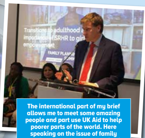
The international part of my brief allows me to meet some amazing people and part use UK Aid to help poorer parts of the world. Here speaking on the issue of family planning to help women and girls in the developing world.